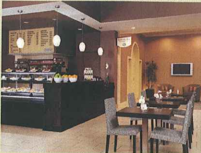
Bakery Café located on the Lobby Level

urge for a cup of coffee after smelling the wonderful Starbucks aroma coming from the Bakery Café. Laura Turner, who has been with the hotel for 24 years, whips up a latte for you in seconds. You hop on the