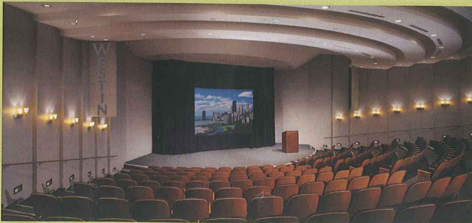
Left: Executive Forum located on the Lobby Level. This unique meeting space seats 218 people, and is a distinctive feature to this hotel.